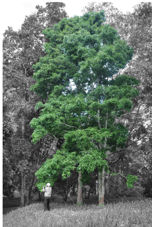
Figure 2. A. laurinum tree of CBG as the subject of the study

The study was conducted at CBG, Cianjur, West Java. CBG is located at 107° 0' 10.476" E to 107° 0' 59.275" E and 6° 44' 6.787" S to 6° 44' 51.112" S. The location is mountainside of mount Gede Pangrango, at an altitude of approximately 1,300-1,425 meters above sea level, with an area of 84.99 hectares (Widyatmoko et al. 2010). The average temperature is 20 °C, humidity of 80.82%, and average precipitation of 2,950 mm per year (Registration Unit-CBG 2018).