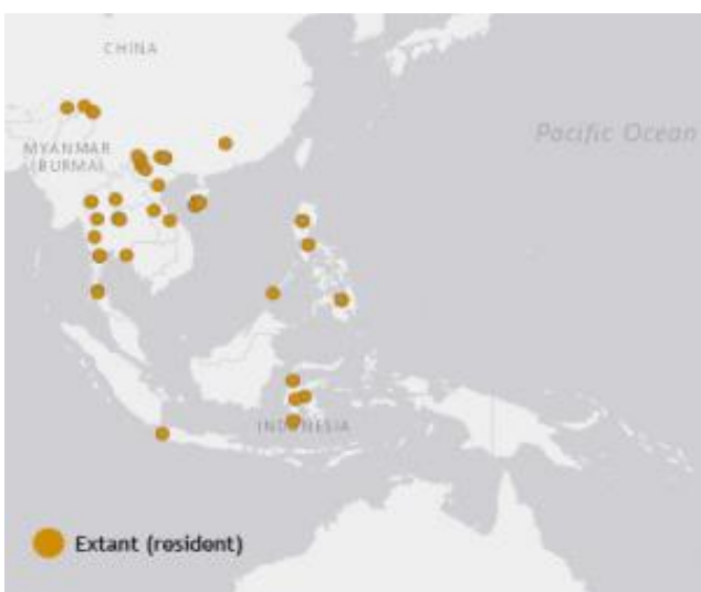
Figure 1. Geographic of A. laurinum

In order to support the conservation efforts of this species, it needs to gather information of flowering and fruiting phase phenology of A. laurinum , which used in the future to plan seed collection and to produce a mass seedling. There are several reasons to construct the phenological calendar i.e., to unravel data about the ecosystem functioning; to obtain data for crop seasonality and to do farm work in the right season; to observe the relation between temperature or other abiotic factors with phenology; to support conservation of other species related with the plants observed; to determine the proper time for plant seed collection, etc. (Sulistyawati 2012).