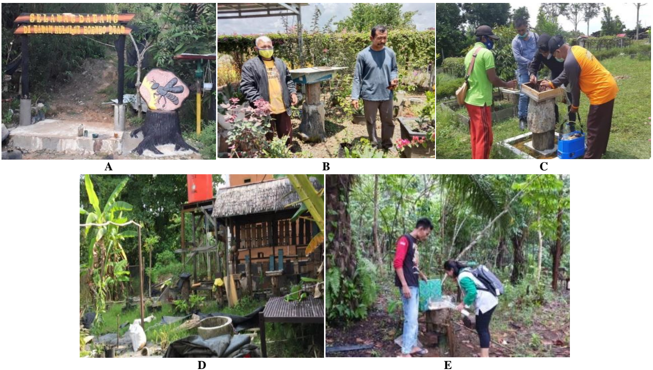
Figure 2. Sampling area of Heterotrigona itama honey on; A. Tanah Merah Village, Samarinda, B. Buana Jaya Village, Kutai Kartanegara, C. Karya Merdeka Village, Kutai Kartanegara, D. Penajam Village, Penajam Paser Utara, E. Saing Prupuk Village, Paser, East Kalimantan, Indonesia