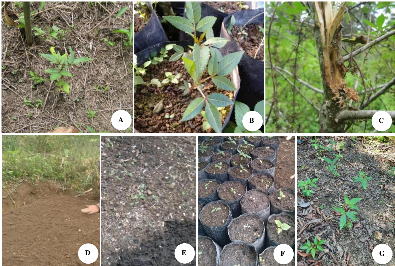
Figure 5. 14. Cultivation of Z. Acanthopodium . A. Wild seedlings in the Andaliman planting area. B. Symptoms of stem borer attack. C. Seedlings that have reached a height of 20 cm are ready to be planted. D. Making a place for Andaliman nursery, E. One to two months later, seedlings will grow, F. After the Andaliman seedlings have grown 2 leaves, they can be transferred to polybags, G. After about 1 month in the polybag, the seedlings are ready to be planted in the field

Based on the farmer's information, seed propagation is done by breaking the seeds' dormancy with high-temperature treatment (soaking in hot water and burning). Z. acanthopodium seedlings are then put in planting holes and covered with soil and organic litter around the roots to maintain the soil moisture. Then, the seedlings are covered with large leaves in the soil and to cover the seedlings from direct sunlight exposure. The planting is usually carried out during the rainy season to reduce the mortality rate of the planted seedlings. Local farmers usually use bamboo to mark the planting spot for Z. acanthopodium seedlings. The activity of planting the seedlings is not conducted simultaneously but depends on the situation and condition of the land and the age of existing trees. If the farmers have a lot of spare land, the farmers usually multiply planting. Also, if many trees are old and considered unproductive, the plants will be replaced, and planting will be carried out again.