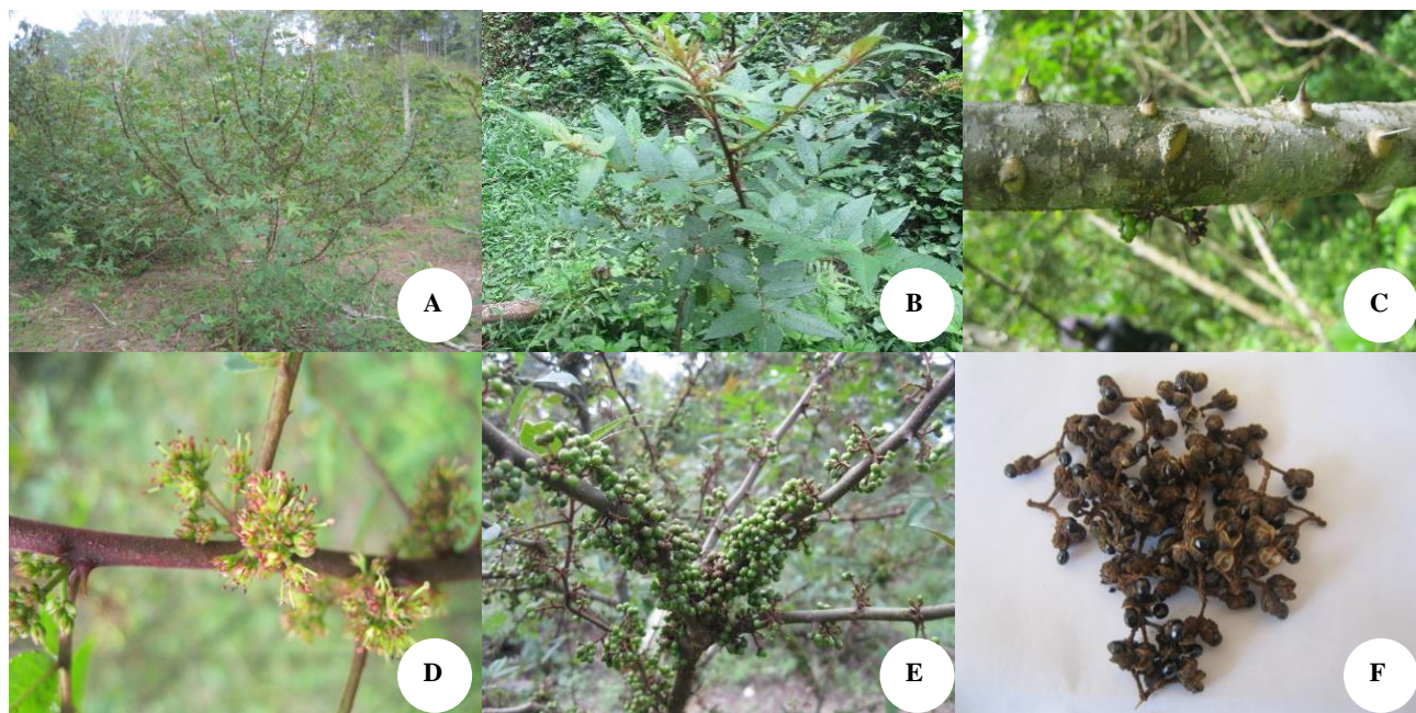
Figure 2. A. Zanthoxylum acanthopodium tree, B. Leaves, C. Stem, D. Flower, E. Fruit, F. Ripe fruit with visible seeds

Flowers grow in the leaf axils or on the stem. Flowers are bisexual and pale yellow, including limited compound flowers. The petals are slightly yellowish-green or slightly reddish-green. There are about 5-7 petals on each flower. The fruit is shaped like a pepper and is green when unripe, reddish when ripe, and black when dry. Each fruit has only one seed. Ripe fruits are protected by hard skin and are round, 2-3 mm in size; each fruit has 1 seed: round seed shape, hard skin, shiny black seed surface, smooth surface; young seeds are white while old seeds are black. The fruit gives off a distinctive aroma in the form of a tart taste on the tongue and a citrus-like aroma. The fruit is utilized as a cooking ingredient and traditional medicine. Seeds have a skin with a very hard structure that can inhibit water imbibition and gas exchange during the germination process. Therefore, the germination and regeneration capacity of Z. acanthopodium is low.