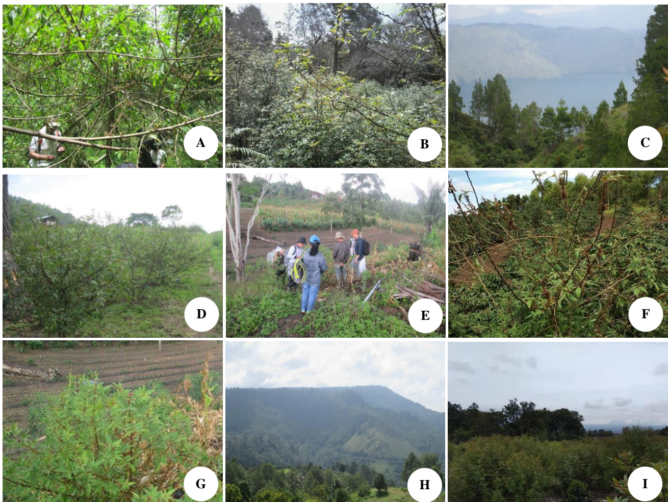
Figure 4. Zanthoxylum acanthopodium growth and cultivation. A. Grows wild in the forest. B. Planted under pine trees. C. On areas with fairly steep slopes. D. Valley area as a location for planting. E. Planted with chilies, tomatoes, and sweet corn. F. Using an agroforestry system planted alongside coffee plants. G. Andaliman is planted next to other crops, such as corn fields. H. Andaliman is planted on land that is not used for cultivation of other crops in the form of an empty area. I. Andaliman planted in the field by planting Andaliman only

Zanthoxylum acanthopodium is planted on land not used to cultivate crops in an empty area. Farmers use land that is still empty for Z. acanthopodium planting areas, and they burn the land before starting farming activities and it will grow within one to two months (Figure 4.H). Z. acanthopodium is allowed to grow, then nurtured and sorted to adjust the planting distance.