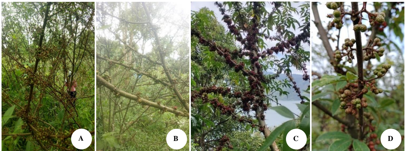
Figure 3. Zanthoxylum acanthopodium habits and fruits. A. Simanuk, B. Sihorbo, C. fruit of the simanuk variety, D. fruit of the Sihorbo variety