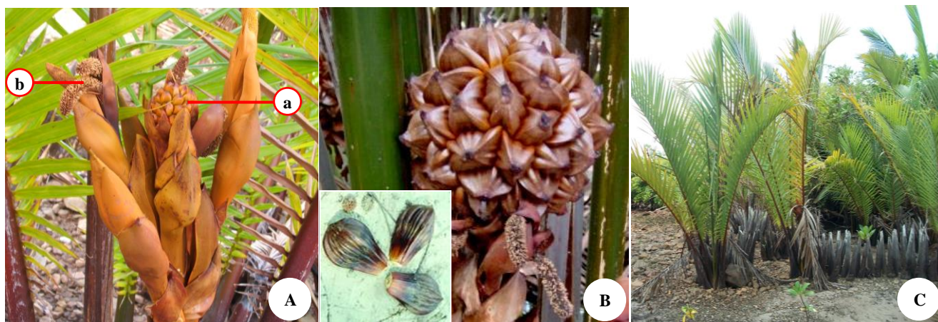
Figure 1. Some parts of Nypa fruticans . A. Flower (a. Female, b. Male); B. Fruit (insert: individual fruits); C. Tree stature with roots and rhizomes submerged in water and leaves standing upright above the water