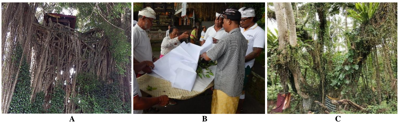
Figure 3. Traditional culture is associated with figs. A. Ficus benjamina in Ubud with massive roots; B. Ngangget don bingin phase in the cremation ceremony sequence showing people collecting F. benjamina leaves using a particular tool; C. The culturally protected F. racemosa at Tegallalang supports many forms of plant and animal life

The five species of the subgenus Sycidium in this study were F. ampelas , F. gul , F. montana , F. subulata , and F. tinctoria . The species in this subgenus are relatively common around the world, mainly distributed on riverbanks and in humid areas, and a few species are found on the beaches or in grasslands (Berg and Corner 2005). All Sycidium species are dioecious. Dioecious figs are more abundant than monoecious figs in tropical regions, usually in the forms of small trees, shrubs, or climbers (Bain et al. 2014). Ficus ampelas is known as amplas-amplas because of its rough leaves. This species is widespread in Indonesia except for Borneo (Berg and Corner 2005). Ficus tinctoria and F. subulata also have a wide distribution in Indonesia. Ficus tinctoria has two subspecies: F. tinctoria ssp. tinctoria , which is distributed in eastern Bali, and F. tinctoria ssp. gibbosa , which is distributed in western Bali (Berg and Corner 2005). Some people in Bali distinguish F. tinctoria from F. benjamina by its leaves. The leaf vein in F. tinctoria is more obvious than in F. benjamina . This is necessary because those two species could appear on the same host tree, such as in Gianyar, where an Alstonia scholaris tree is strangled with F. benjamina and F. tinctoria .