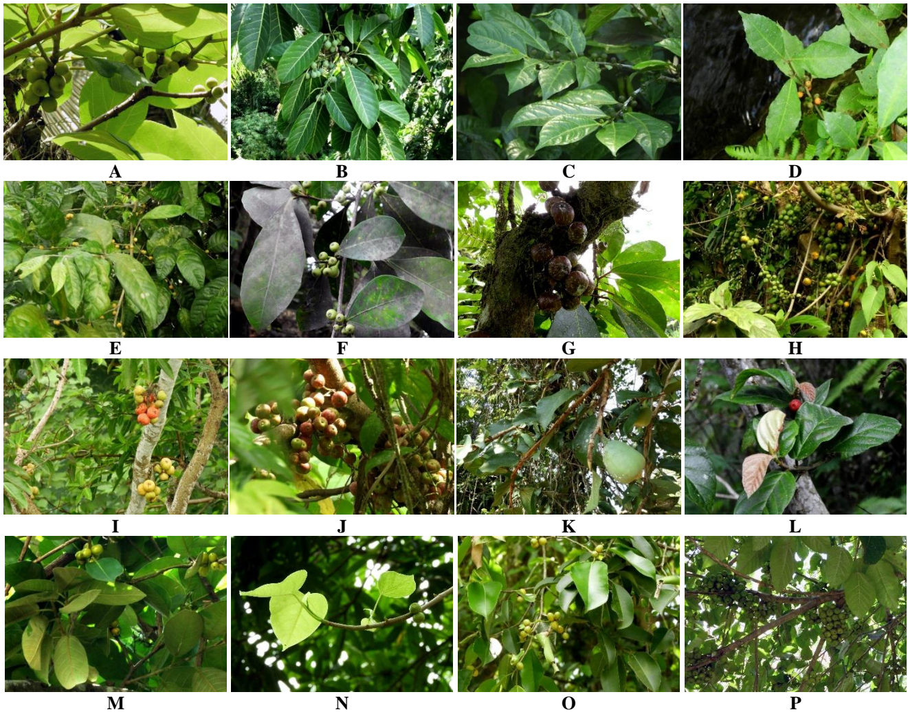
Figure 2. Fig species found in Gianyar, Bali. A. Ficus fulva ; B. Ficus callosa ; C. Ficus ampelas ; D. Ficus montana ; E. Ficus subulata ; F. Ficus tinctoria ssp. gibbosa ; G. Ficus fistulosa brownish-purple fig variation; H. Ficus hispida ; I. Ficus racemosa ; J. Ficus variegata ; K. Ficus pumila ; L. Ficus trichocarpa ; M. Ficus drupacea ; N. Ficus rumphii ; O. Ficus subcordata ; and P. Ficus superba