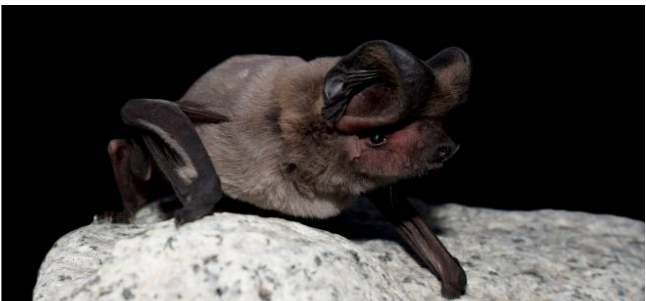
Figure 1. External morphology of the living individual of Eumops chiribaya (MUSA 20972) collected in Ocoña Valley, Arequipa, Peru