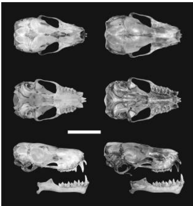
Figure 2. Dorsal, ventral and lateral views of cranium and mandible of Eumops chiribaya from Peru. Left, holotype (MUSA 8493); and right, specimen collected in Ocoña Valley (MUSA 20972). Scale bar equal to 10 mm.

Mormopterus kalinowskii (Thomas) is another bat species that are sympatric with E. chiribaya (Medina et al. 2014). These records shown complex trophic relationships in the bat community that allow the coexistent of many insectivorous bat species (Pari et al. 2015), a fact that has been discussed by some authors in relation to bat sizes and its preys (Freeman 1981). So, if follow the statement of Muñoz and Molinari (2000) it is probable that the diet of E. chiribaya is mainly composed by big insects, like Coleoptera and Lepidoptera species.