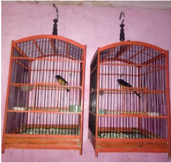
Figure 1. Matchmaking process between a couple of White-rumped Shama bird