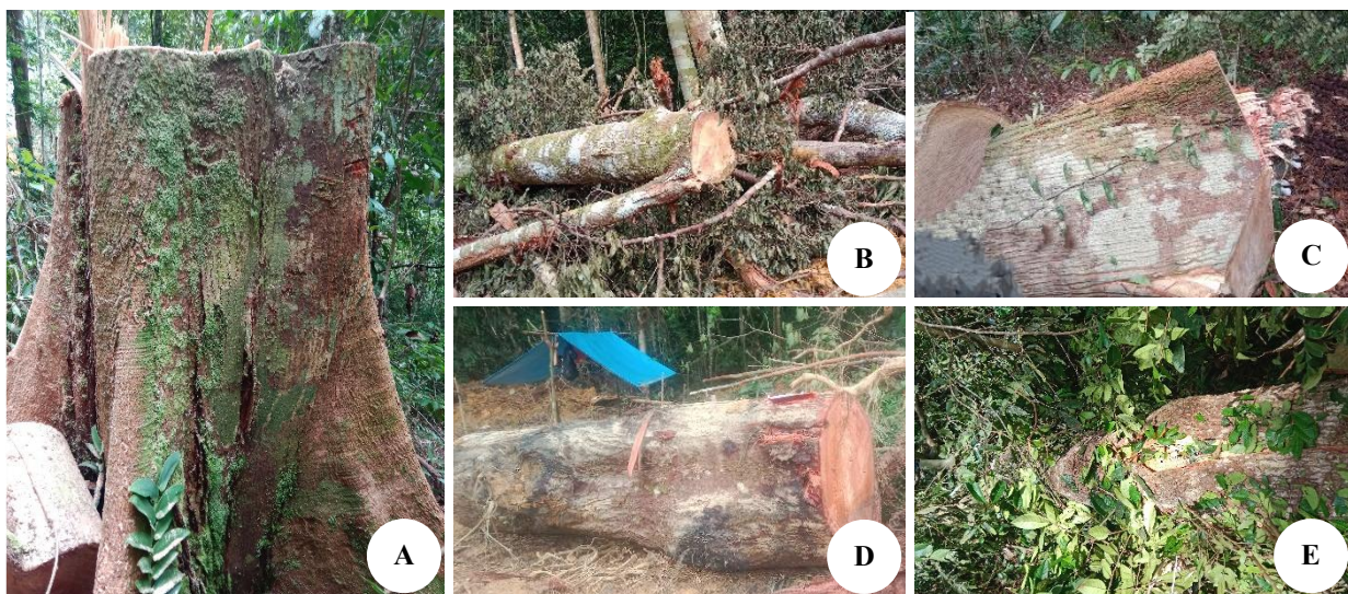
Figure 2. Form of logging waste in felling plots: A. Buttress stump waste, B. Tip waste, and C. Base waste and landing areas, D. Wood knots, and E. Broken stem