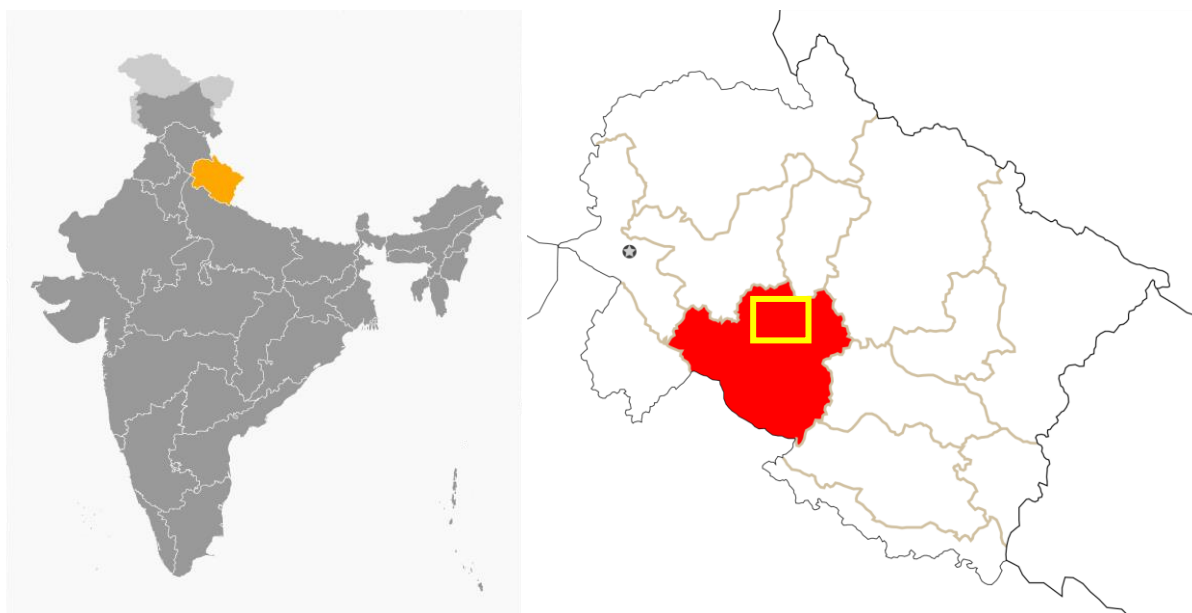
Figure 1. Study site in Bharsar, District of Pauri Garhwal, Uttarakhand, India