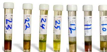
Figure 2. Hydrogen peroxide ( H_2O_2 ) accumulation in cucumber plants under CGMMV infection