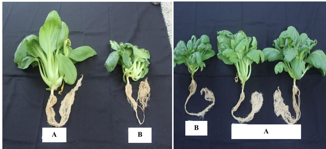
Figure 1. The performance of plants: A. Treated with banana corm MOL, B. Without banana corm MOL application