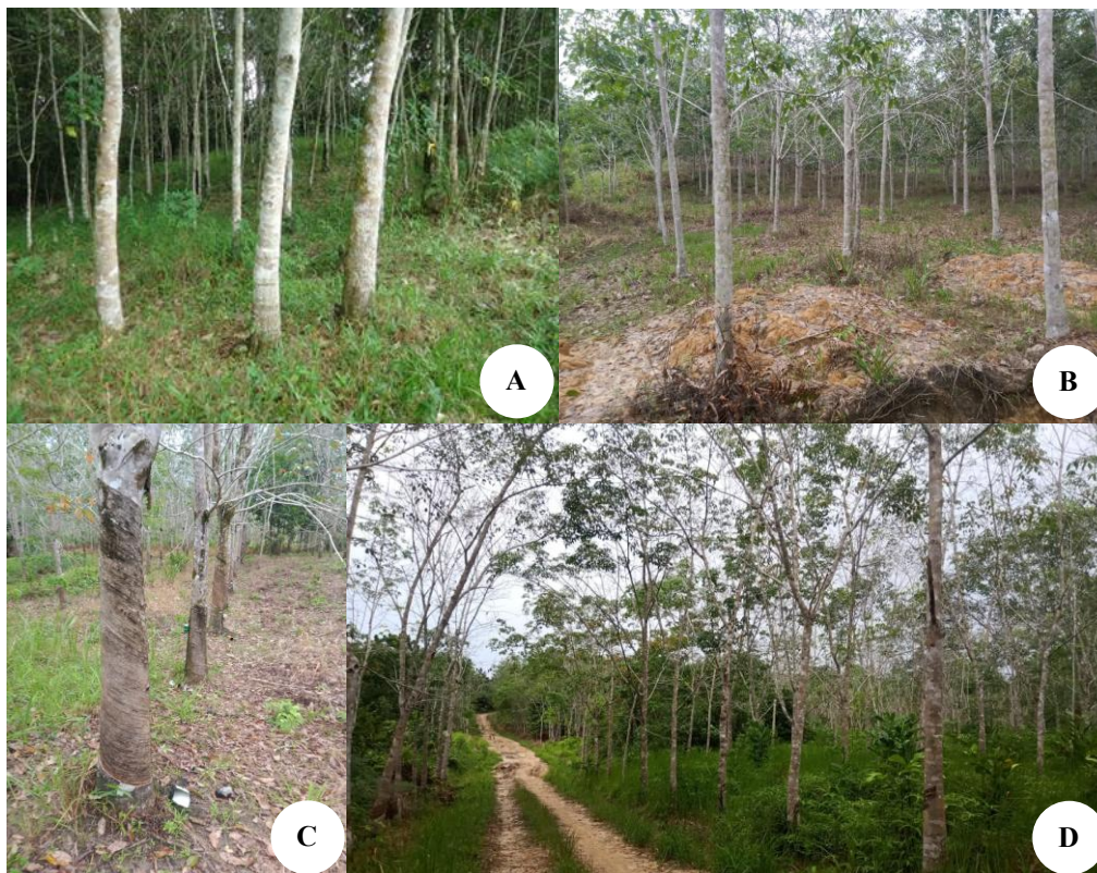
Figure 2. The condition of the rubber planting distance is in Sintang District, West Kalimantan, Indonesia. A and D: Irregular planting distance, B and C: Neatly arranged plantations with planting distance that meets the rubber GAP